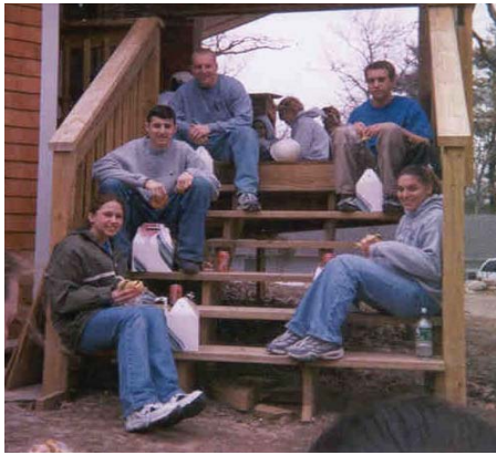
Students will work at a variety of local sites during the Day of Service, planned for Saturday, September 5th

The Day of Service is a program currently being developed by the college's standing New Student Orientation Committee. In speaking recently with colleagues from other colleges and universities, members of the committee found that several other campuses host service projects for their incoming classes. The committee agrees that a Day of Service would not only benefit the local community, but would also help bond the incoming class, help them to immediately learn more about the surrounding area, and provide additional opportunities for student, faculty, and administrator interactions.