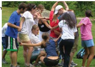
Below: Participants untangle a "human knot".

As a first-time Transformations leader, I discovered that life is a bit different from this point of view than from that of a new student. I now appreciate what those before me have done and what those after me will do - not just for the Transformations Retreat, but any getaway that PC kids have the honor of attending. If it weren't for others, I wouldn't be where I am today, and it is such an overwhelming feeling to know that my co-leaders and I will have the same effect on the class of 2010 and those after them!